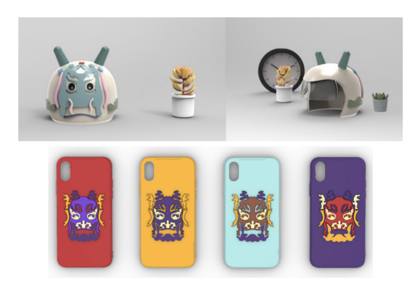
Figure 4. Nuo mask pattern used in the creative design of helmets and mobile phone cases

acceptance of the current people and has a sense of intimacy. Let the roots of traditional culture be integrated into the design of current tourist souvenirs, let the public feel the breath of life conveyed by ancient culture, and nourish people's hearts (Xie, 2018) (As shown in Figure 4). Simplify the design of the Nuo mask and incorporate it into the design of the helmet and mobile phone case. The overall shape is cartoonish and gives people a sense of intimacy.