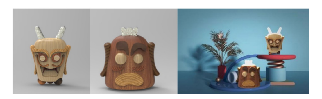
Figure 5. Creative design of Nuo mask music box light

Case 3: The application of digital media has brought the whole people into a new stage (Xu, 2020). With the rapid development of the new era, ordinary traditional cultural creations are no longer popular with the public. The continuous development of digital creative products, the integration of intelligent technology into the development of Nuo mask tourism products, increases the interactivity of the products, effectively improves the user experience, and makes the product meaning more diversified (Figure 5). Simplify the shape of the Nuo mask and combine it with the sound and night light, and you can feel the joy and joy of music and the atmosphere of light. In order to better display and restore the body feel of the Nuo mask, wood is selected as the raw material in the design, and the audio and lighting are controlled through voice, which increases the interactivity and playability of the product.