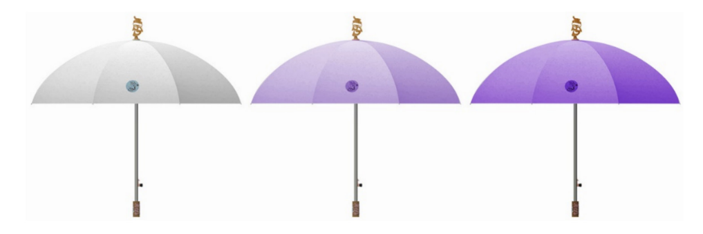
Figure 2. Nuo mask pattern used in the creative design of sun umbrella

Case 1: Taking the daily necessities "sun umbrella" as the design carrier, incorporating the elements of Nuo masks into it. The handle of the umbrella is made of cherry wood, the shape of the Nuo mask is simplified and then carved on it and given different colors as decoration. The top of the umbrella is also designed with a Nuo mask woodcut, which adds a sense of freshness and visual charm. Make it have inheritance, innovation and culture, etc., so that it can better have emotional resonance with the public, and can better spread the Nuo culture. Combining the needs and hot spots of the current new era, it adds new demand points for umbrellas. Umbrellas are not only a tool for sheltering from wind and rain, but also to test the strength of ultraviolet rays. The change of color from light to dark indicates that the ultraviolet rays are changing from weak to strong, reminding people to take relevant measures while attracting the attention of others and inspiring their curiosity about new things (Figure 2).